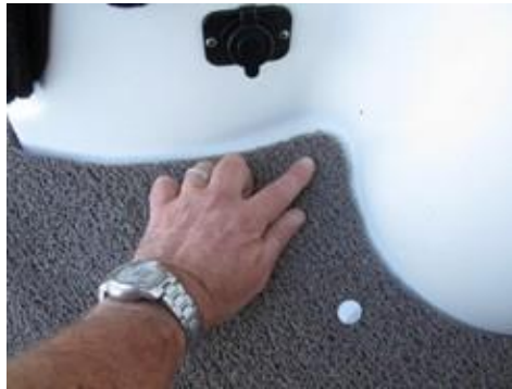
Remove peel back and press