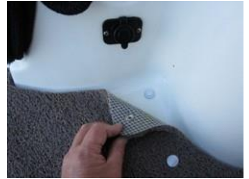
Male is attached to deck with no holes