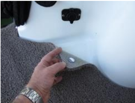
Male affixed to female

Male peel and stick snaps which you can easily place by cleaning the area and once the DECKadence placed properly, simply remove the paper back and press firmly in place.